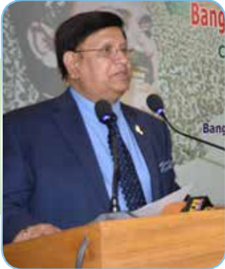
H.E. Dr. A K Abdul Momen Honourable Foreign Minister, Bangladesh