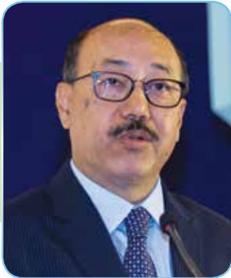
HE Shri Harsh Vardhan Shringla