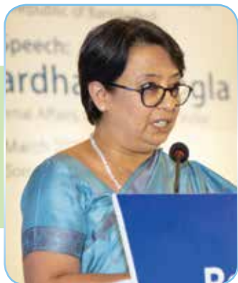
Smt. Riva Ganguly Das

High Commissioner, High Commission of India to Bangladesh